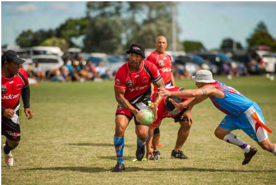
Tag football RL Legend Ruben Wiki playing for Counties Manukau Cyclones 35s Men's